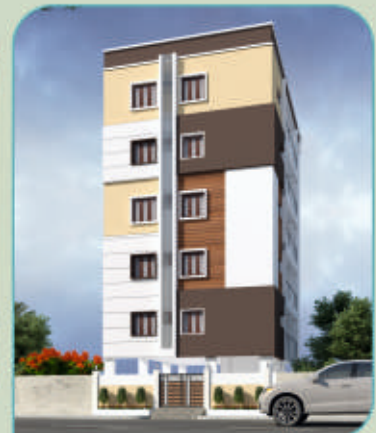
SAI BALAJI PARADISE Bengaluru