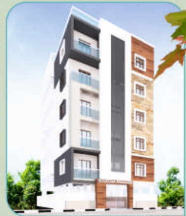
SUVEDHA PARADISE Bengaluru