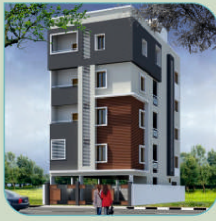
SAI BALAJI ENCLAVE Bengaluru