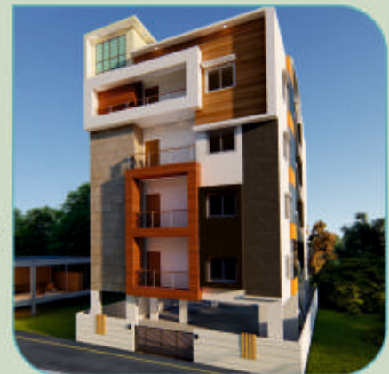
SUVEDHA LUXURIA Poorna Prajna Layout