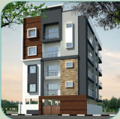
GALAXI ELITE BSK 3rd Stage