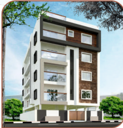
SWASTIK ELEGANCE , V V Puram