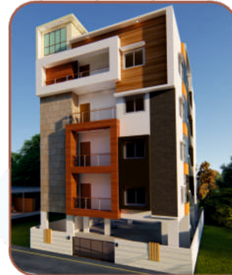
SUVEDHA LUXURIA Poorna Prajna Layout, Bengaluru