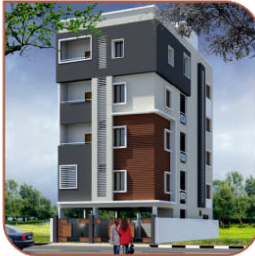
SAI BALAJI ENCLAVE , Bengaluru