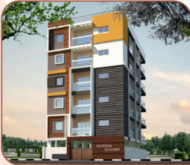
SUVEDHA ELEGANT , Srinivasnagar