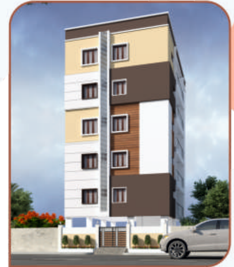
SAI BALAJI PARADISE Kathriguppe, Bengaluru