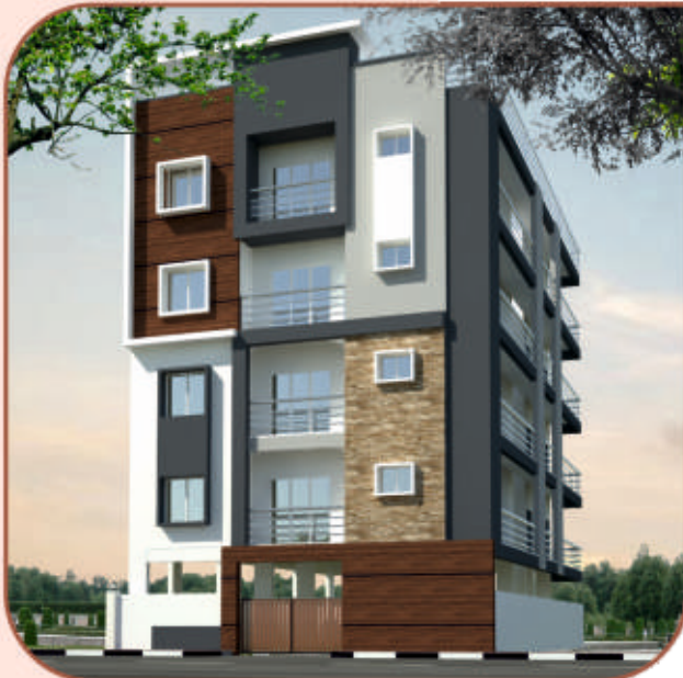
GALAXI ELITE , BSK 3rd Stage