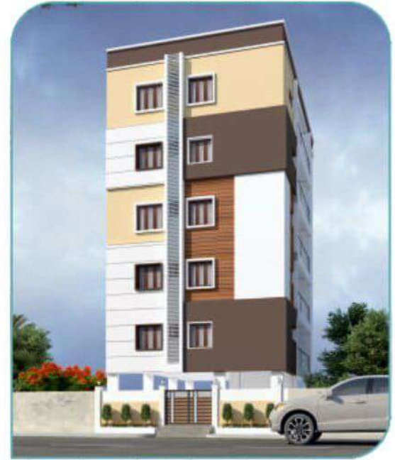
SAI BALAJI PARADISE , Bengaluru