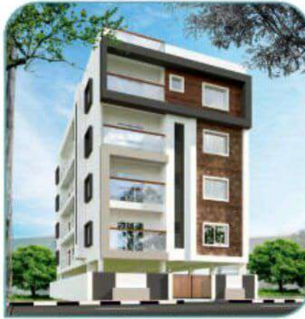
SWASTIK ELEGANCE , V V Puram