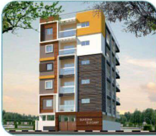
SUVEDHA ELEGANT , Srinivasnagar