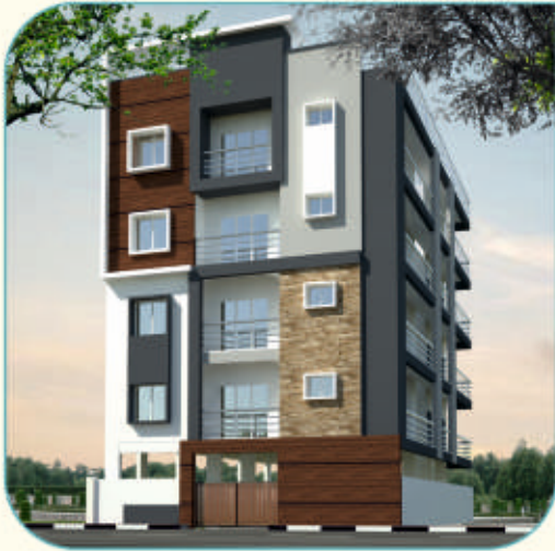
GALAXI ELITE BSK 3rd Stage