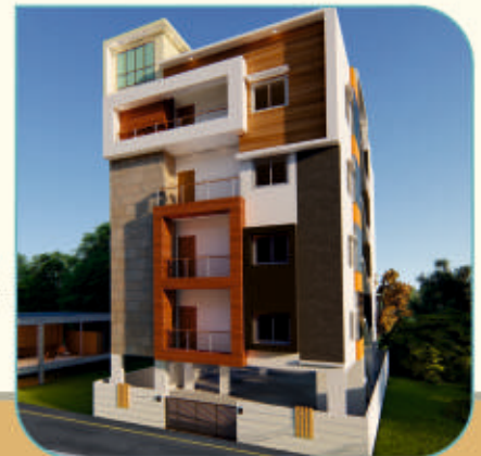
SUVEDHA LUXURIA Poorna Prajna Layout