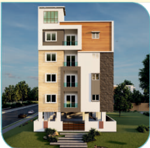
SUVEDHA PRIDE Rajaraajeshwarinagar